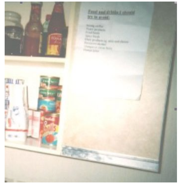
Figure 5: Food Instructions - what to avoid

Routines reveal what Zerubavel (1985) regards as the 'temporal rhythms' of social life - a notion that provides a way for us to think about person's everyday activities: visiting people, going shopping, taking medication, etc., repeating activities over time until they get absorbed into and become part of the routines making up and articulating particular care settings. The notion helps us understand aspects of everyday life in these settings by highlighting its intrinsically temporal and cyclical nature.