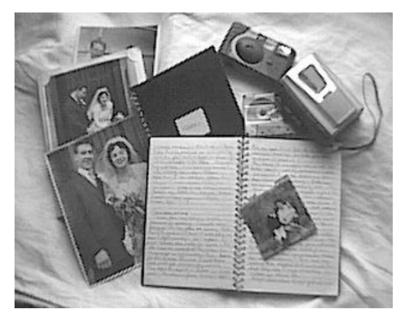
Figure 1. Informational Probes Pack

In the case of the elderly, a booklet was provided rather than a set of instructions in order to provide a more enjoyable focus the activity and also to provide a gift that we could return as a reminder at the end of the project. The booklet asked elderly participants to describe which rooms were used most often, their favourite activities, activities they would like to do or missed being able to do, the various kinds of technology they used, and so on. The stroke victim and her husband also allowed a researcher to record parts of their daily household routines on video.