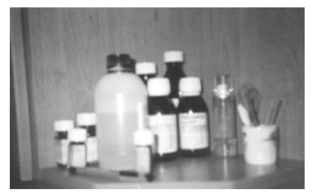
Figure 2. Dorothy's Daily Medication

Managing medication appears to be another abiding concern. It is quite common amongst people with strokes, for example, for them to have other illnesses